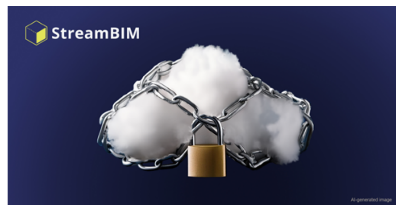
StreamBIM online On-Prem lets you enjoy the benefits of working in a cloud-based solution while minimising data exposure to the wider world of third-party networks.