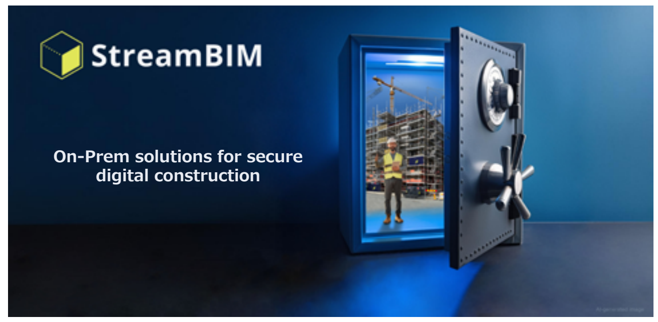
StreamBIM offline On-Prem lets you enjoy the benefits of digital construction on-site with maximum data security.